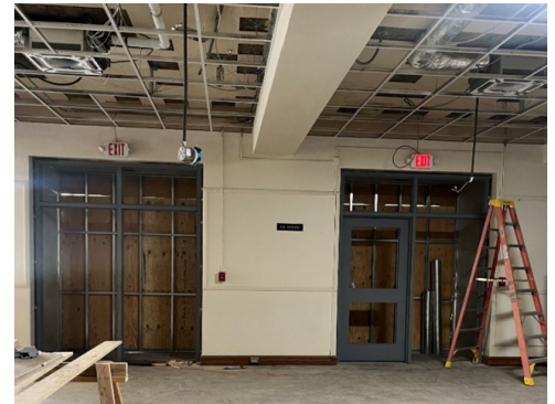
The Main Library Community Meeting Room being outfitted with new doors onto the Madison Street courtyard.